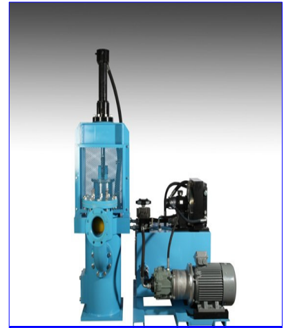
Latham Vertical Ram Pump