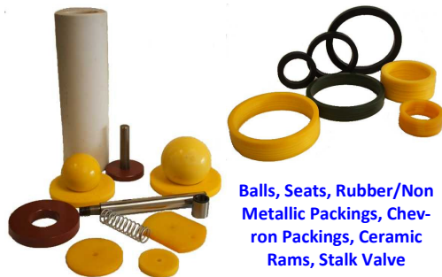
Balls, Seats, Rubber/Non Metallic Packings, Chevron Packings, Ceramic Rams, Stalk Valve

Many other parts are available on request.